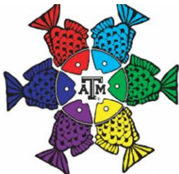
Aggie Mom Fish Camp XX

Aggie Mom Camp Aggie Mom Camp will be held November 22 nd – 24 th in College Station. The camp is held at the MSC with sleeping accommodations at Four Points by Sheraton. The theme this year is Aggie